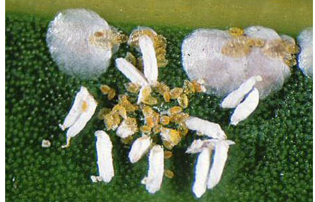
Figure 4. Adult female scales are disk-shaped, while the male scales are elongate. The first instars (called "crawlers") are the little amber colored individuals in the center of the picture.

A systemic insecticide is needed in order to reach the CAS that feed hidden away. A systemic, applied as a root drench, would be absorbed into the root system and then move upward in the vascular pipelines and diffuse into the foliage and kill the scales that are on the fronds and hiding under the thick woolly material on the trunk (Figure 3), as well as the scales feeding on the roots. Merit® applied as a soil application has given unreliable results. A root drench of the systemic, dimethoate (Cygon® 2E, 2 oz per gallon/plant), gave 95% control of the adult scale in November 2002 in my test.