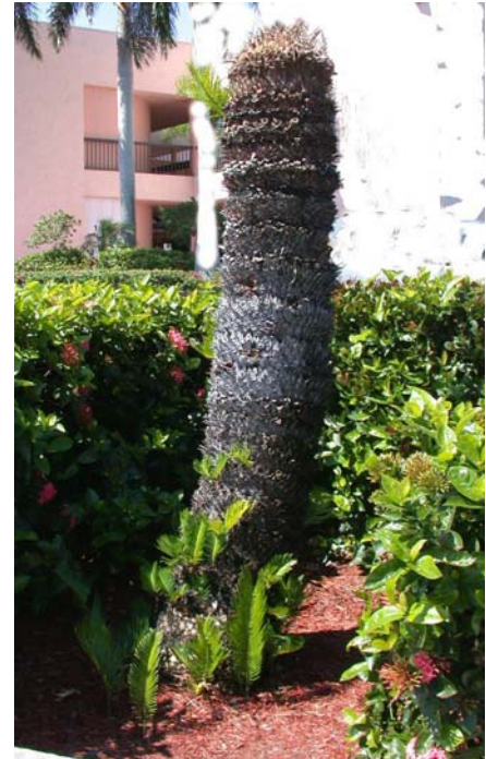
Figure 1(above) and 2(right). Cycad aulacaspis scale insects have encrusted this sago like barnacles on a ship. Without intervention, this sucking insect will eliminate these classic plants from the Florida landscape. Figure 2. Over pruning ("bullet-head" pruning) of CAS infested fronds has made an eyesore of a previously beautiful king sago in the landscape.

Over the last five years, landscapes in Naples have probably lost over 70% of their king and queen sagos (cycads) due to the relentless attack of the cycad aulacaspis scale (CAS), Aulacaspis yasumatsui , a small white scale from Asia. CAS arrived in the Naples area about 1997. It is first noticed after it has established on the undersides of the dark green fronds changing them to a glowing white, so that the cycads resemble a small flocked Christmas tree (Figure 1). This flocked appearance is sort of attractive, but the sagos react adversely to the piercing-sucking feeding activity of this scale and turn brown and die within a quick two to three year period. What was once a low maintenance centerpiece has now become a high maintenance eye-sore (Figure 2).