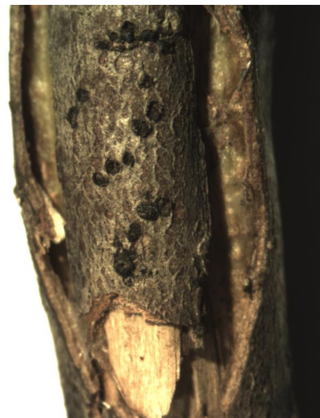
Figure 3. Pycnidia on artificially infected branch.