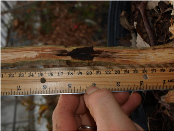
Figure 4. Stem of Q. muehlenbergii wound inoculated with D. corticola , showing phloem necrosis (localized black spot) and xylem staining extending up the branch.