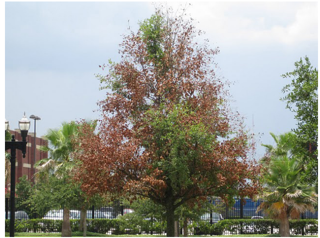
Figure 1. Live oak ( Q. virginiana Mill.) showing dieback

The possibility that grapevines might have been the source for infection of oaks by D. corticola in California has not been investigated. Sprinkler irrigation triggers spore release in vineyards just as rain does (Urbez-Torres et al., 2010a, 2011), possibly increasing nearby oaks’ exposure to infection, and oaks are used in the wine industry for both corks and casks. Cross-infection would seem to be within the realm of possibility.