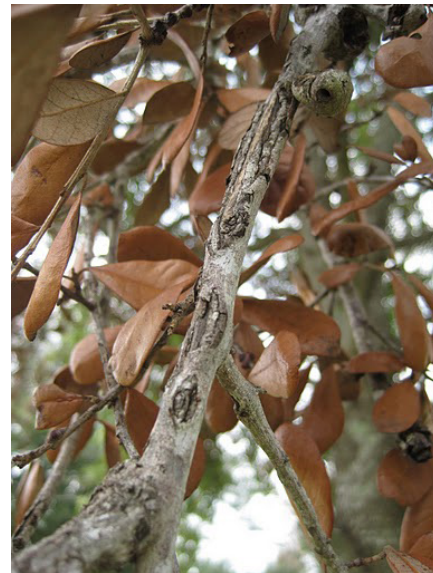
Figure 2. Cankers on naturally infected live oak branch.