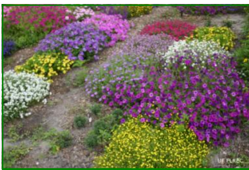
Spring 2010 South Evaluation Plot