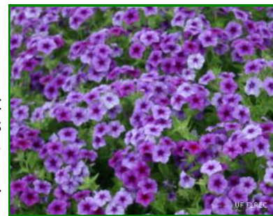
Phlox Intensia Blueberry