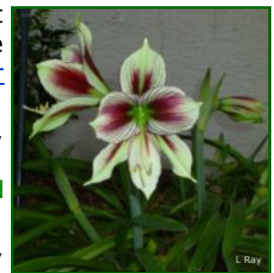
Amaryllis in bloom

Flowers: Plants that thrive now include begonias, browallias, lobelias, dianthus, dusty millers, and nicotianas.