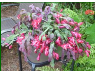
Christmas Cactus with magnesium deficiency.

Nutritional Deficiencies: When cool weather arrives, some plant leaves may droop and even turn purple. Treat this magnesium deficiency with Epsom salts (magnesium sulfate). Mix 8 rounded tablespoons Epsom salts into 2.5 gallons of water. Add a drop or two of liquid detergent and spray plants.