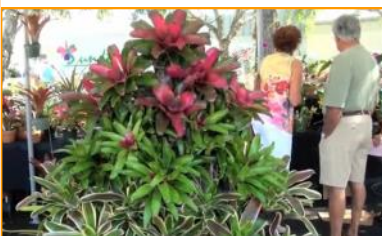
Vendor booths have many colorful plants for sale

This annual garden show and sale, hosted by UF IFAS Collier Extension and the Master Gardeners, will be held Saturday, October 27th from 9 am - 4 pm, and Sunday, October 28th from 9 am - 3 pm on the Collier Extension Office grounds at 14700 Immokalee Road , ten miles west of I-75, and adjacent to the Collier County Fairgrounds.