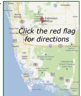
Click the red flag for directions