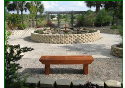
Tranquility reigns in the Garden of the Senses

Entrance admission, payable in cash as you park, is $3.00 / adult; children under 12 are free. And as you park, keep that door prize ticket you receive. You just may win one of our hourly drawings for door prizes, compliments of our vendors. So treat your family and friends to gifts galore at the Yard and Garden Show!