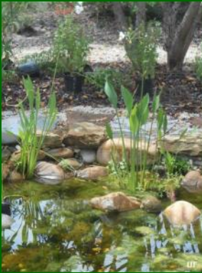
Aquatic plants in Native garden pond

Be sure to visit the Horticultural Learning Center HLC gardens , where you'll find eight different gardens and a fruit orchard with a variety of plants that perform well in SWFL sun and shade. Pardon our dust, since the gardens remain open as we continue the renovations. But the Garden of the Senses is now full of fragrant blooms for butterflies, and new native plantings and a revived water feature are the stars in Naida's native garden . Enjoy a self-guided stroll, or stop by the Master Gardener Plant Clinic to request a guided tour.