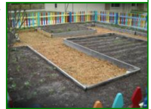
Sanders Pines Community Garden in Immokalee

Holiday Plants: Reduce watering of Christmas Cactus to a minimum. Discontinue feeding and make sure poinsettias, Christmas cactus, and kalanchoe receive no night time light for best blooming. It is too late to prune poinsettias. Begin forcing amaryllis and narcissus, and try some of the many bulbs described in UF article CIR552 Bulbs for Florida .