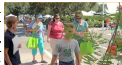
4-H youth will deliver your purchases to your vehicle

This year's show features a select group of vendors , both local and from around the state, offering an exciting selection of plants that attract birds, butterflies and hummingbirds. You'll find bamboos,